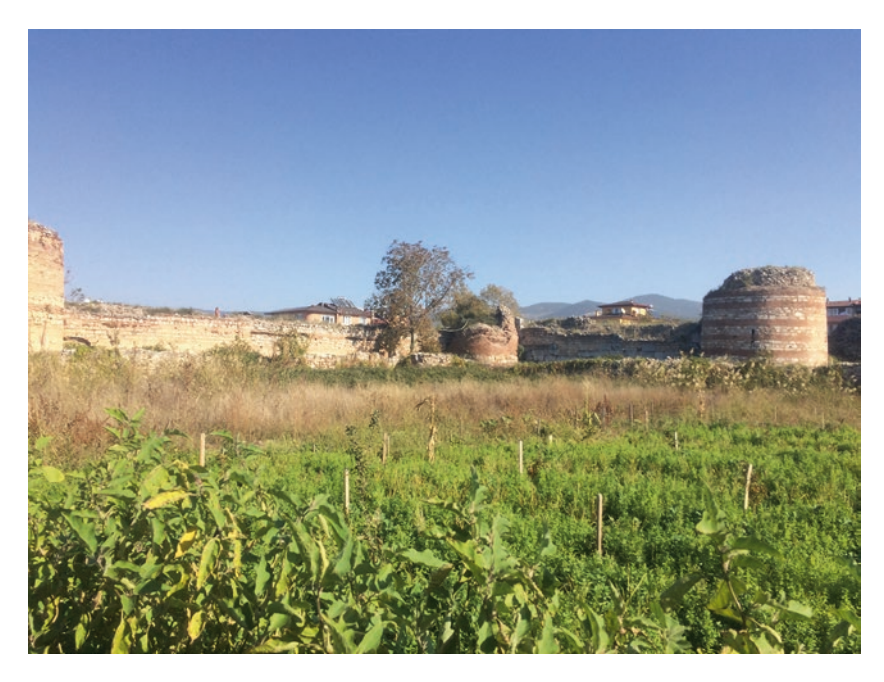
Fig. 2.2 Nicaea, city walls (fifth to thirteenth century)